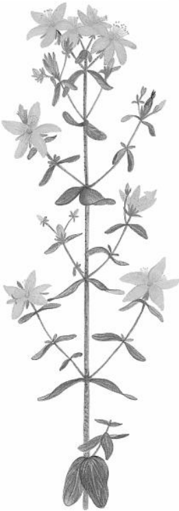
St. Johns Wort